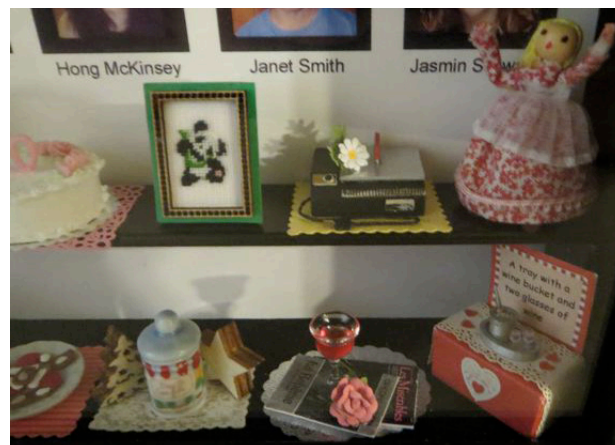
More swap items