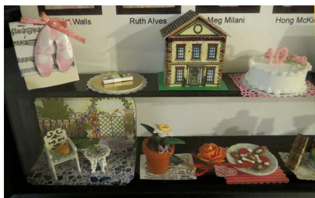
Swap items for the box