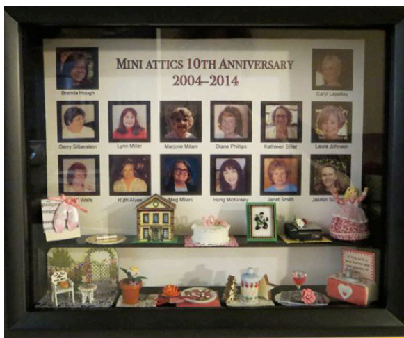
MiniAttic's Anniversary box