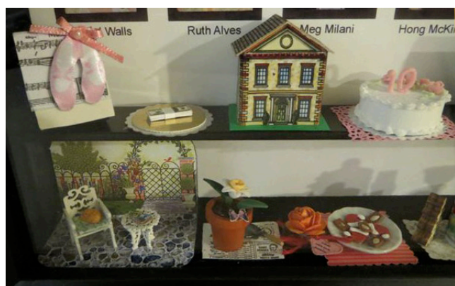
Swap items for the box