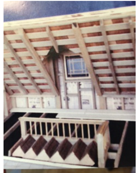
Eureka Small World project