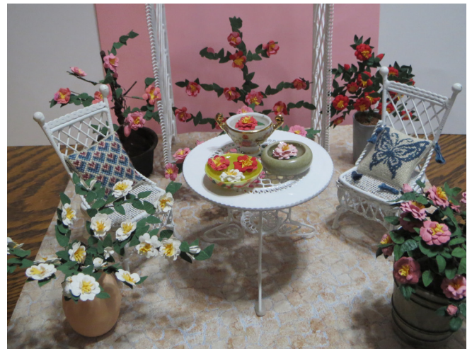
Camellias on display from a Mini Attics workshop taught by Lynn Miller