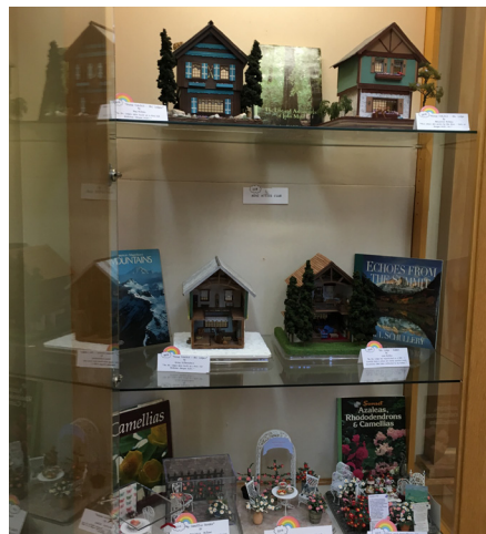
MiniAttics library display

MiniAttics: Our Traveling Display—The Mini Attics display from the Good Sam Show traveled to the Redwood City Public Library (main branch), and will be there November and December. Our two-part display shows off our Ski Lodges, which