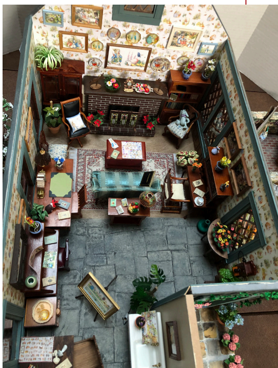
Meg's Beatrix Potter Hilltop House entry