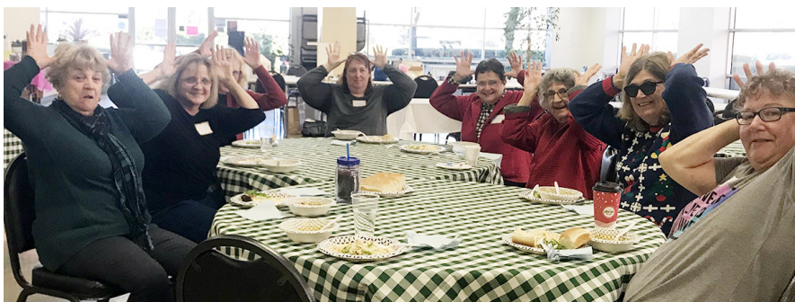
Members of the MiniCals Club of San Jose, CA make reindeer antlers during lunchtime at their fundraising event