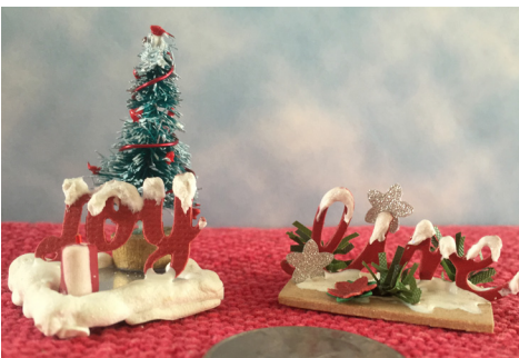
Table decorations made by the club