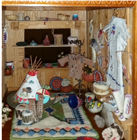
The Indian Shop is one room in Adam's Shop complex. All the leather items—dresses, moccasins and drums, were hand-made by Norma.