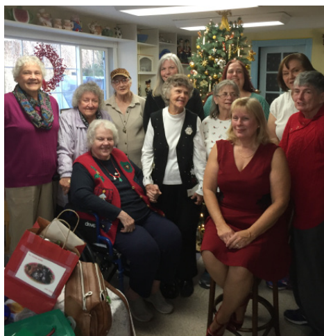
A happy spring to all.