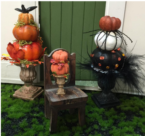
Dorelee's pumpkin topiaries

The project for the day was a peddler's cart. We spent days cutting wooden parts for a kit for everyone to assemble. Next month we'll add more parts to finish the utility cart. We also welcomed another new member to our club, Trisha Church of McKinleyville, CA. Trisha likes to work with polymer clay and dreams up all kinds of wee folk to fill her scenes. Welcome Trisha.