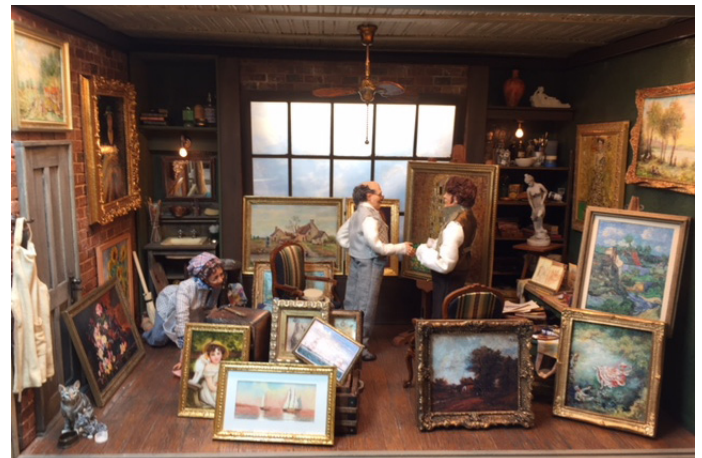
Partners in Crime