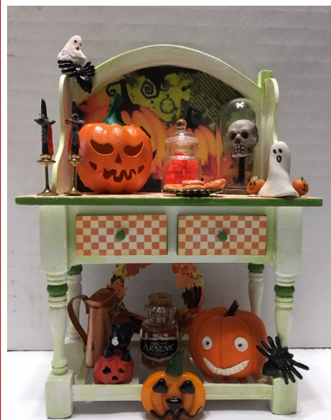
Carlene's Halloween themed table