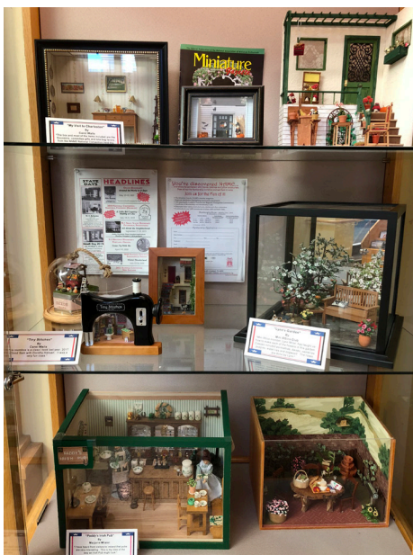
Mini Attic's library display