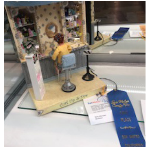
Gerry's first place fair entry