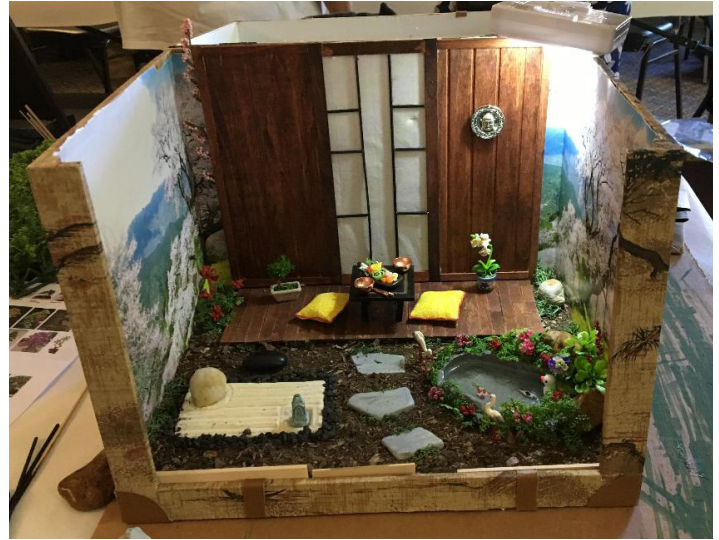
Diane Baumflek's Zen garden