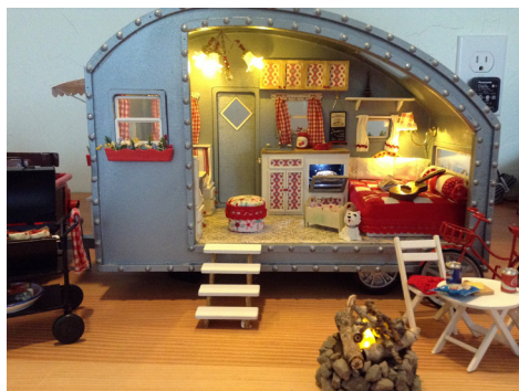
Sue's travel trailer