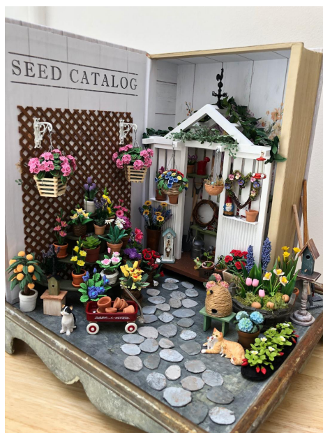
Carol's Garden book box