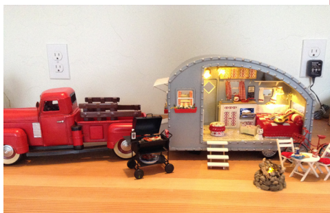
Sue's travel trailer