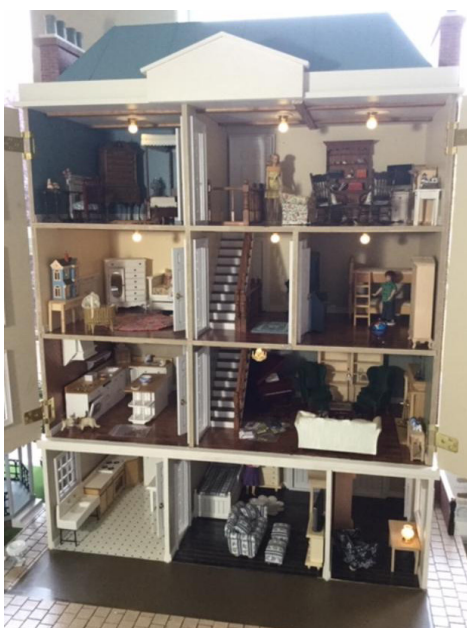
Christa's English dollhouse interior