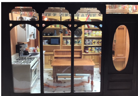
Brenda's Sous la Table (Under the Table version of the Sur la Table store chain)

We have not been able to hold our monthly club meetings, but we are looking forward to resuming them. Meanwhile, some of our members have been