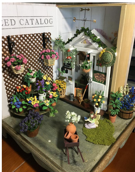
Cathy's Garden book box