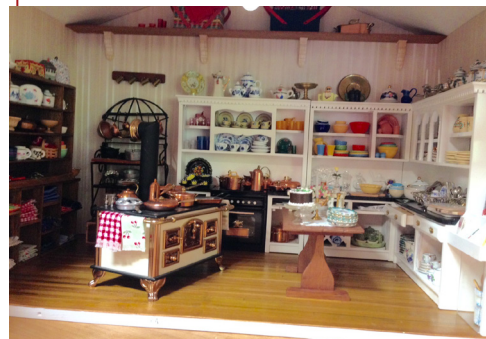
Ruth Heisch's kitchen shop interior