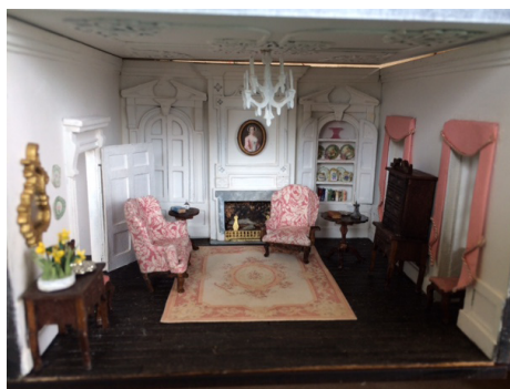
Laura's Petworth Philadelphia drawing room

MiniCals: Like everyone else, the MiniCals have had to make many changes in the last few months. We have had to cancel our popular Spring Fling event and our Attic Room Workshop. We hope to schedule these in 2021 and you should have been contacted if you had signed up for any of our workshops.