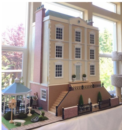
Christa's English dollhouse exterior