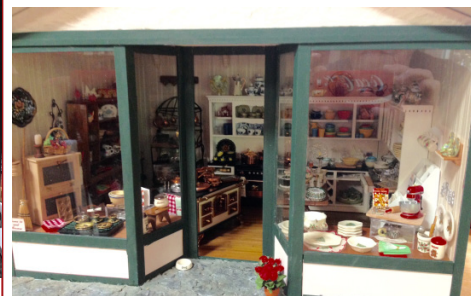
Ruth Heisch's kitchen shop exterior