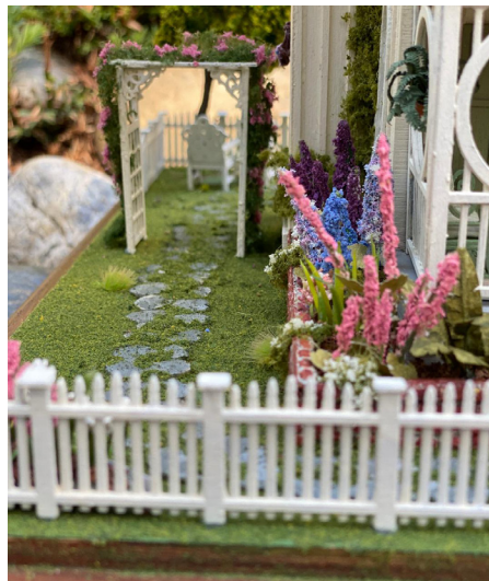
Denise's Pickett Hill exterior