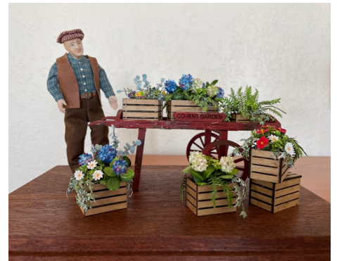
Laura's Coventry Gardens flower cart