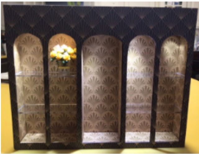
Terry Unold's prototype