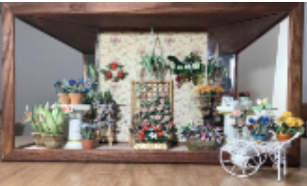
Margaret's roombox of flowers