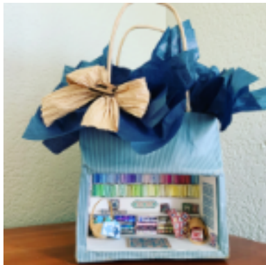
Cindy's fabric store