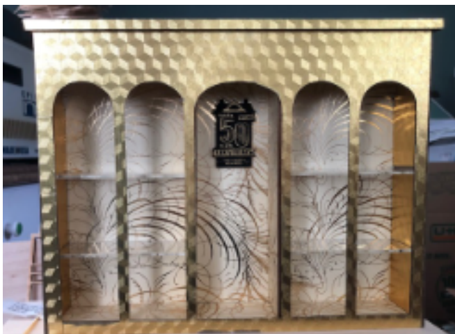
Connie Reagan's prototype with lights