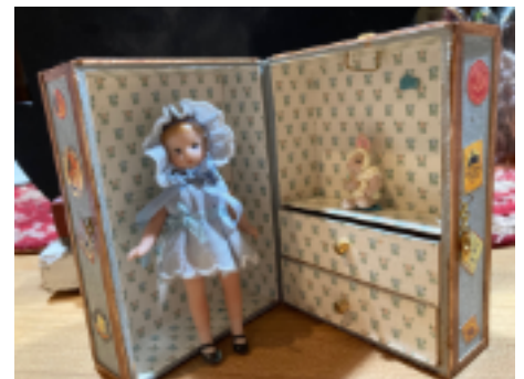
Steamer trunk in April workshop (doll not included)

Workshops start at at 10 am M&L Precision Machining 18665 Madrone Parkway Morgan Hill, CA