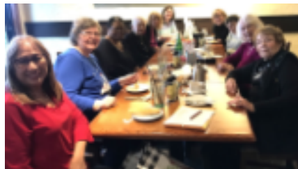
Itty Bitties Christmas luncheon

Quarter Persuasion: Our Quarter Persuasion club met in person to celebrate the holidays in December. We gathered together for lunch on a Monday at 11 am (our regular meeting day and time) at The Cheesecake Factory at the Roseville Galleria. It was so wonderful to see everyone that made it there. Five of our six local members attended. I thought it was funny that we ate at a restaurant famous for their desserts, but we all only ate lunch (and didn't order dessert). I hadn't been to any of the Cheesecake Factory locations since before the pandemic, and I wasn't the only one. We didn't do the "bring a gift, get a gift" idea that we did last December. But three of us did bring an item for all the others (even though that wasn't the plan). It was fun to give. It was fun to receive. We hadn't managed to get together in the spring, so we hadn't seen each other in person as a club since December 2021. We had a lovely time, chatting, catching up, and enjoying each other's company.