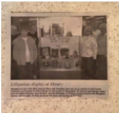
Members of Our Little Mini Club with their display at the Chico library