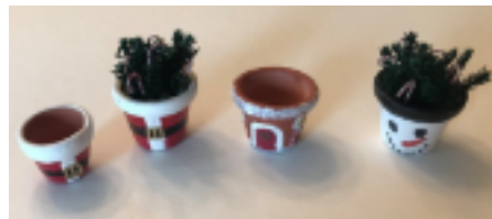
Itty Bitties decorated flower pots