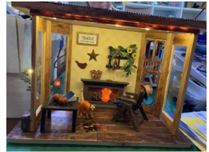
Cassie's finished roombox