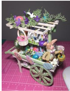
Easter cart with Fimo bunny with Cat Wingler