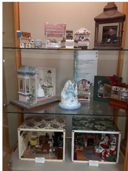
Mini Attics Redwood City library display