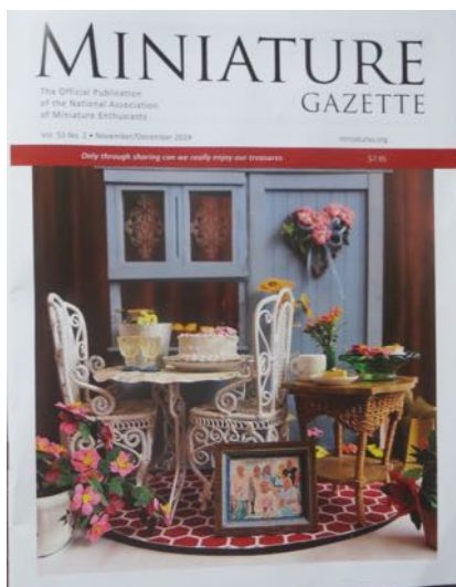
Meg's NAME Day project on the cover of Miniature Gazette