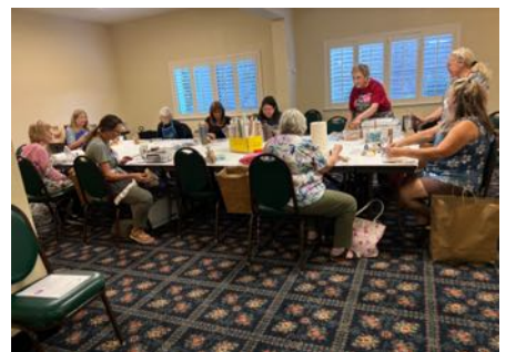
Ladies are working hard on their projects at the NAME Day in Sacramento