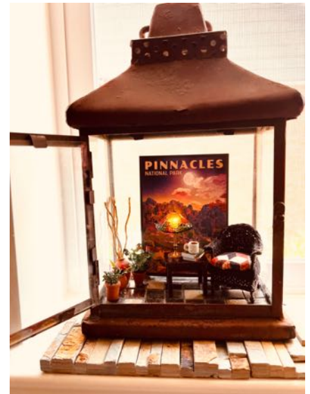
A perfect container for Cindy's Pinnacles exhibit

Wee Housers: The Wee Housers club members continue to work on their individual projects. We're hoping to have a meeting soon.