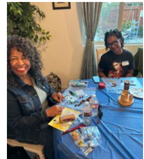
Sac Vally's first meeting