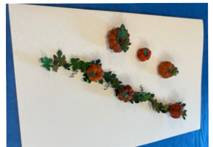
Ynez's pumpkin vine project