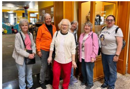
Mini Attics members working on the Redwood City Library display