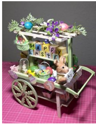
Easter cart with Bonnie Helterhoff