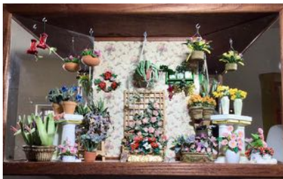
Zoom flower class with Debbie Laue, Dragonfly International