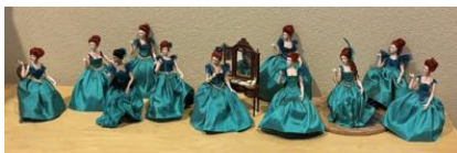
Examples of completed Projects