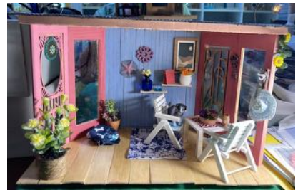
Beth's finished roombox