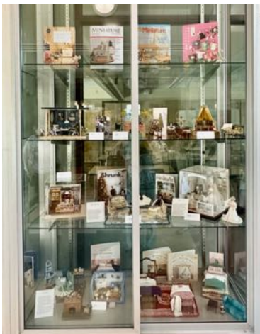
Itty Bitties library display