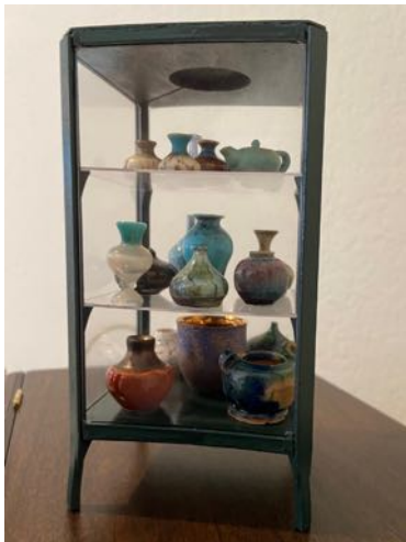
Rafael Acevedo's Display Case, the NAME 2025 Club Project