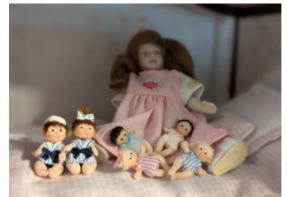
Some of the 1" scale baby dolls for your doll that Laura bought in the past few months from miniature dollmaker Alicia Volta from Portugal (AligraDolls on Etsy). These are three sets of twins made from clay. I have them sitting in or near the lap of my 1" scale porcelain doll I made as a teenager (age 15 or 16).