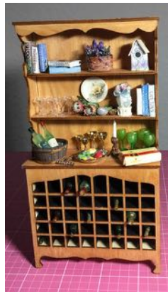
Wine class with Castle Crafts' Belinda McWilliam