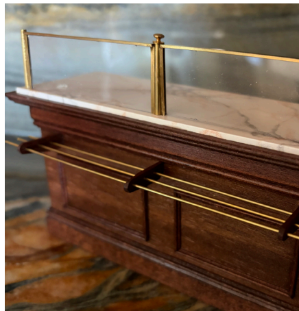
Rhona needs a special pin for her shop counter