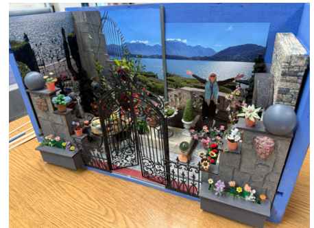
Meg's Lake Como box