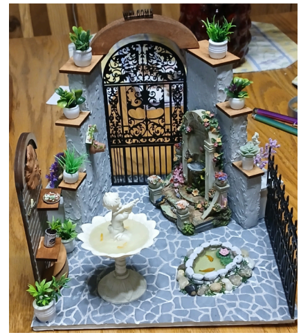
Diane's NAME Day courtyard