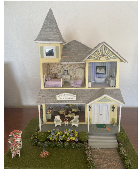
Laura's Bed and Breakfast