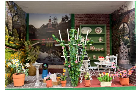
Flowers are abloom in Meg's Filoli box