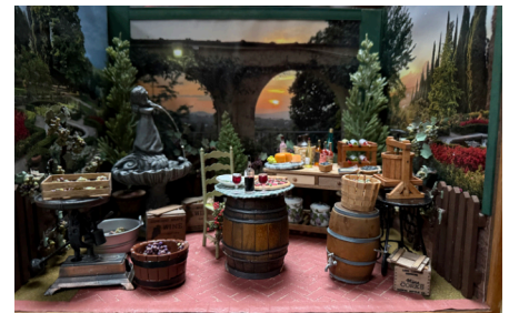
Meg's Tuscan winer box